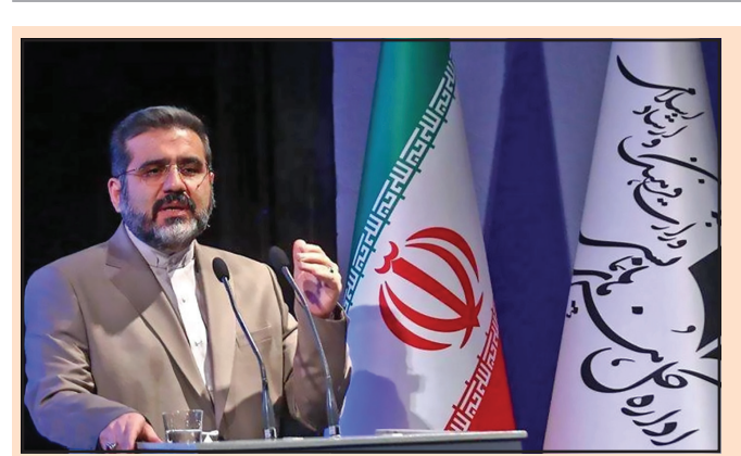
With the clear support of the Minister of Culture and Islamic Guidance